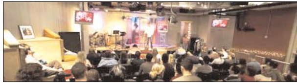
Every Saturday night Ebenezers is transformed into a place of worship and reflection.

Recognizing this shift in culture, churches today are becoming increasingly strategic about providing a Third Place to meet a growing need for community contact.