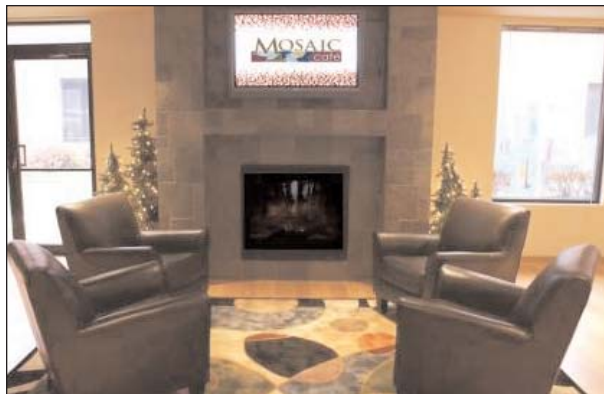
The Mosaic Café in Decatur, IL offers a place for moms to come and fellowship while their children safely play in an adjacent area.