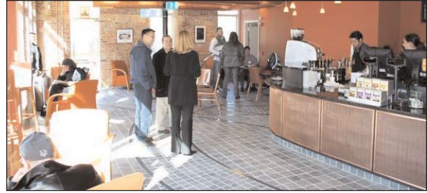
Friends gather for fellowship at Ebenezers coffee shop in Washington DC.

According to Ray Oldenburg, an American sociologist who first coined the term, “Third places are distinctive informal gathering areas that make one feel at home and allow people to relax and unwind after a long day at work.” 1 They nourish relationships, promote companionship and help create a sense of place and community. The concept of the Third Place is not new. In bygone eras it happened naturally in the social patterns and community centers of small-town America.