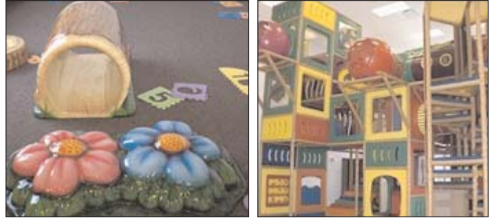
The Playland area at First Christian Church is a great place for families to connect.

A similar concept flourishes at First Christian Church in Canton, OH ( http://www.firstchristian.info ), where the church has built a Playland for kids. Open to the public