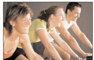
Transformation Fitness Center in Edmond, OK offers personal training, basketball, aerobics classes, and even massage therapy.

A gym may not be as relaxing as a coffee shop, but it nonetheless can serve as a viable Third Place. The people at Transformation Fitness Center, run by Henderson Hills Baptist church in Edmond, OK ( http://www.hhbc.com ) believe that, like Jesus, they are called to help heal people physically, emotionally and spiritually. A businessman in the church donated a fitness center to the church comprised of a 1100-square-foot full service gym. Clients pay dues