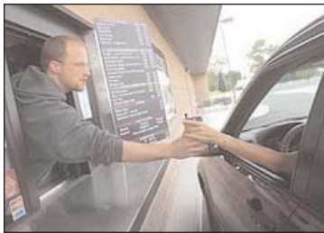
Ordering a cup of coffee in the drive-through is a non-intimidating way for people to take a first step toward getting to know Messiah Lutheran.

“And we have a drive-through. We’re at a nice crossroads for people heading into the city in the morning. Drive-throughs allow the people who are still freaked out about church to get the best cup of coffee possible. They are starting to form a relationship without stepping inside.