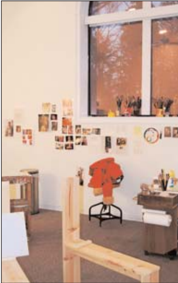
The Museo Arts Studio is a space set aside at the Church of the Redeemer for artist in need of a place to create.

Church of the Redeemer is located on the northern perimeter of Atlanta, GA ( http://www.redeemeratlanta.org/ ) where its foyer is set up as an art gallery.