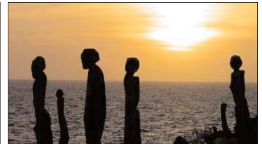
The Sacred Space at New Providence Community Centre in Nassau Bahamas is a meaningful place for community members to come and reflect.