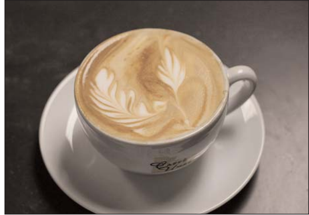
Journeys Coffee shop in Midland MI offers the community a place to gather and one of the best cups of coffee in town.