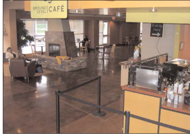
The café at Community Christian Church in Naperville, IL not only offers wireless but also supplies a few computer terminals.

To accomplish this goal, churches need to be intentional about their strategy. “You must align your café’s vision with your church’s vision and DNA, he advises. “A café with a genetic match to your church is one that has been birthed and conceived from your unique vision and mission. How is your church unique? What is scarce in your community? What about your church would the community miss if you closed your doors tomorrow?” 7